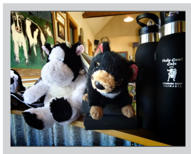
Our little conference mascot has been continuing his travels of Tamania, this time making friends with the cows at Pyengana Cheese!